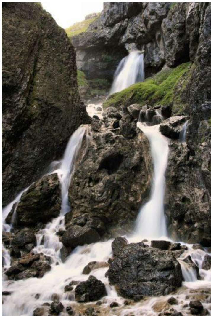
Gorsdale Scar

The club is planning our next long distant range of walks to Malham on Sunday 23rd June. The club plans to travel via Skipton where non-walkers can alight for a feast of festivals and summer activities. We are publishing now to give you time to reserve important 2024 calendar dates. Further information will be forthcoming in 2024.